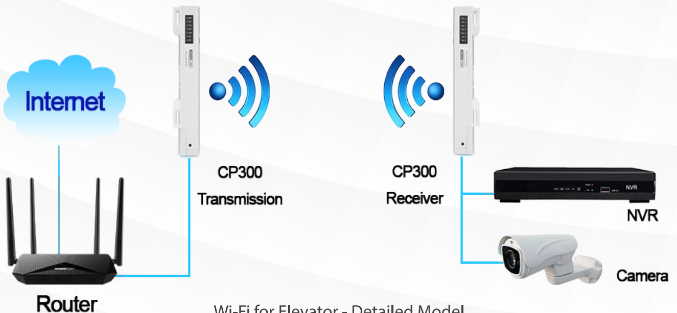
Wi-Fi for Elevator - Detailed Model